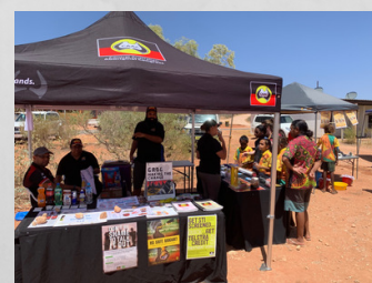
Central Australian Aboriginal Congress Stand