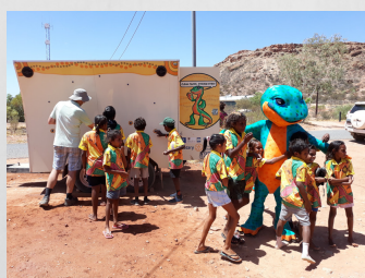
Our Water Trailer and Milpa

The Water Trailer was certainly welcome in the heat of the day, and well used by both adults and children. It was noted that the music provided great ambiance.