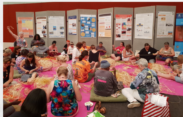
Conference: Interactive Basket Weaving Session